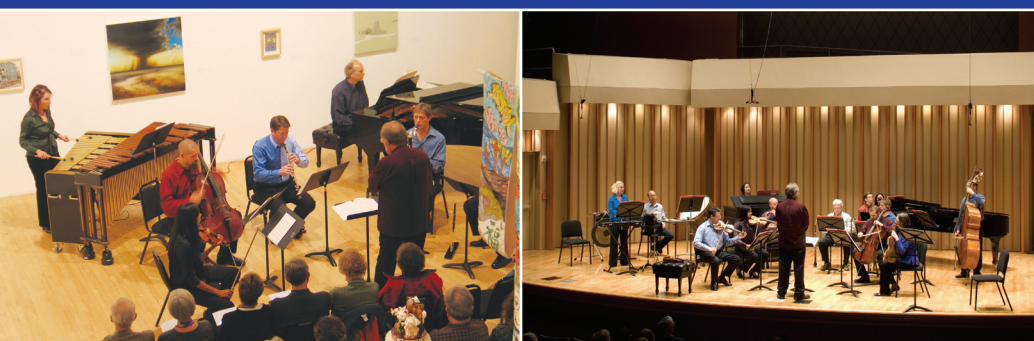
ARMORY CENTER FOR THE ARTS PASADENA